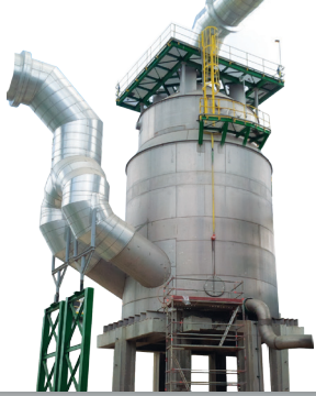
Stainless steel, nickel alloys or titanium shell and tubes heat exchangers