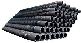
Graphilor® 6-meter-long tubes in a single piece with carbon fiber-wrapping