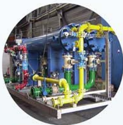
Sulphuric Acid Dilution Units