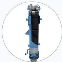
Heat Exchangers Graphitic Blocks, shell and tubes